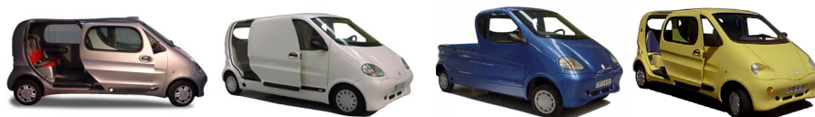
Taxi Van Pick-up Family Car